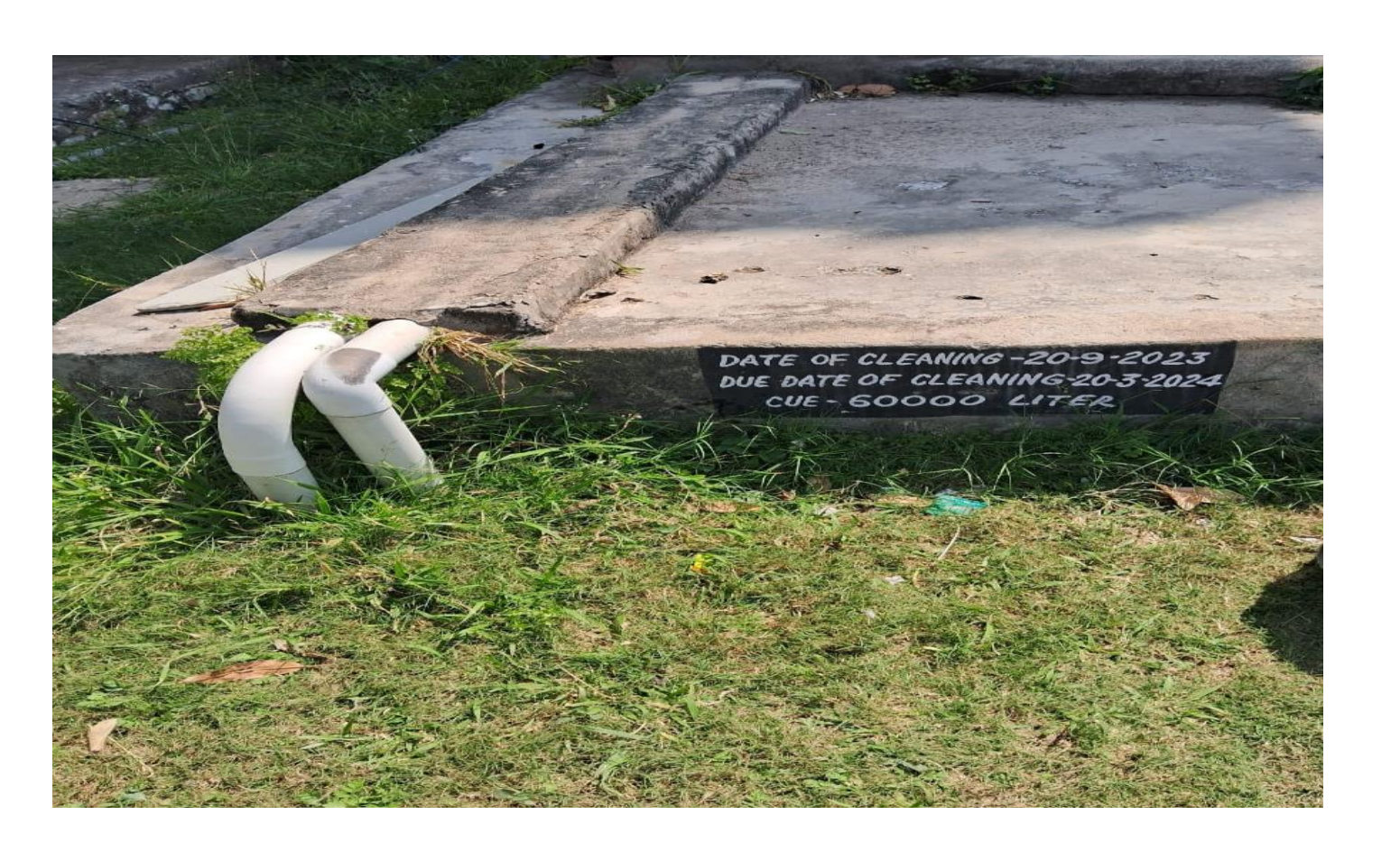
Water Harvesting (Closed Tank)